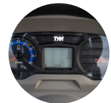
6. Digital instrument panel