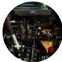
3. 4-port rear hydraulic valve