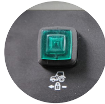
1. Cruise control switch

Take on tough jobs in tight spaces with the T495. This tractor brings you the best features from our compact and utility ranges, balancing high power output with maximized maneuverability.