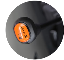
4. 3-range HST & 8F x 8R gear transmission