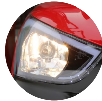
2. Projection headlights