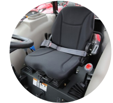
5. Suspension seat for operator comfort and security