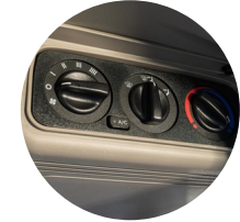
4. Cabin with full A/C and heating