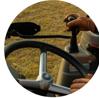
1. Hydrostatic power steering with tilt

With engineering that enhances efficiency and deluxe features that you expect of a TYM utility tractor, the T754 enables all-round productivity, for your operations.