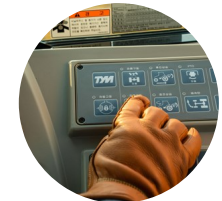
5. Automatic PTO switch