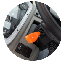
2. Power shuttle