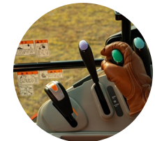
6. Control panel