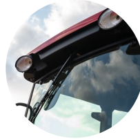
1. Front wipers

Take utilization to the next level with one of the largest TYM tractors. The T1004 is equipped to tackle the toughest of jobs with maximized productivity.